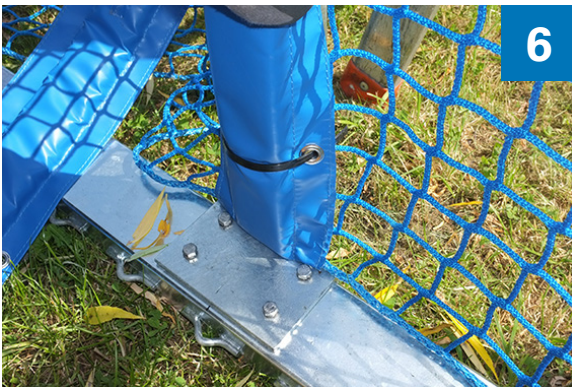
6- Fixing of the fence support pads.