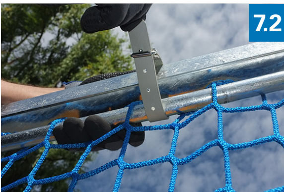
7.2- Detail of the strap fixing.