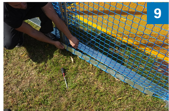
9- Fixing of the flat steel at the ground trampoline frame.