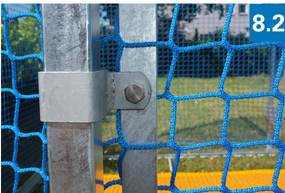
8.2 - And fixing of the fence support.