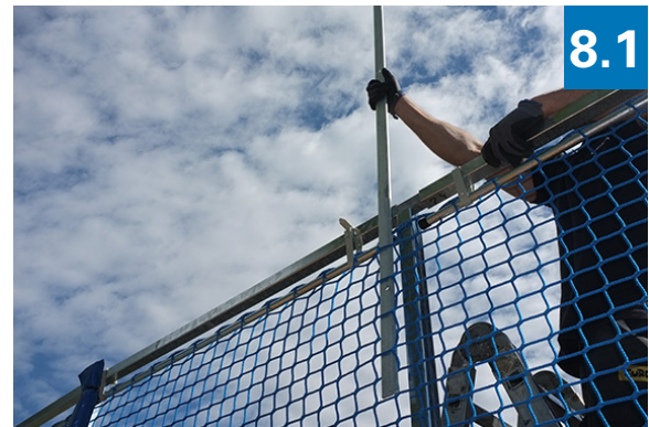
8.1- Insert of the flat steel and fixing of the fence support.